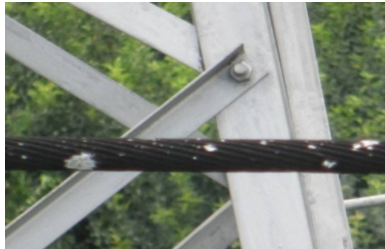
Fig.1. Discharge traces of wind deflection fault on the East -III- line

Historical data shows other incidences of wind damage to 500kV transmission towers in Jiangsu; for example, the collapse of several 500 kV towers in the Ren-Shang- 5237-line, which is an important line for the area's West-to-East transmission channel. This accident caused 10 transmission towers to collapse in a row, causing power failure across a very large area[1].